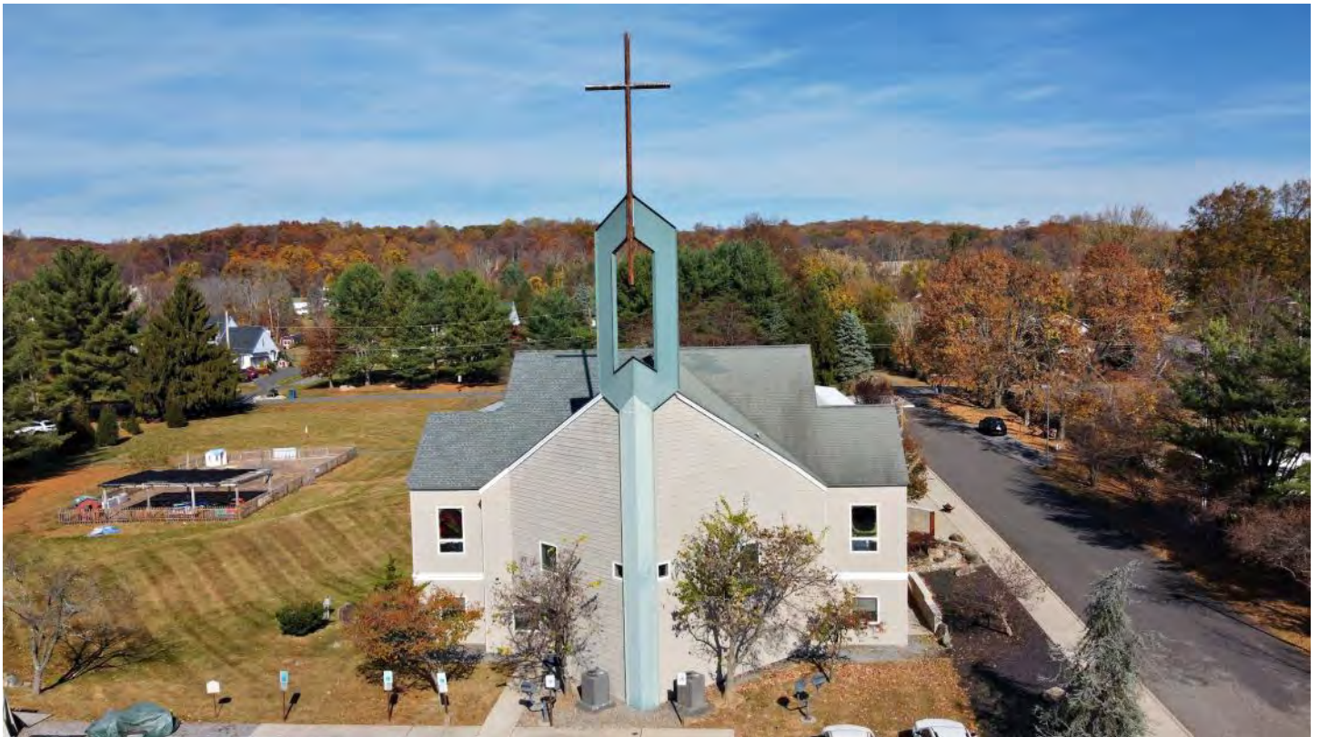
November '24 Aerial Photo

OUR MISSION: to become like Christ as we serve others, proclaim God's love, and grow in the Spirit