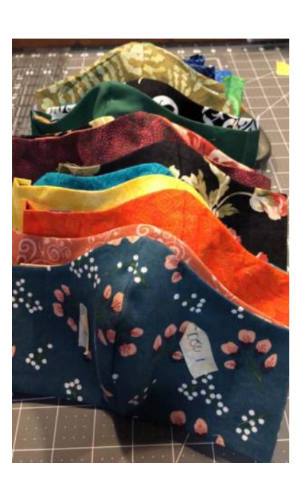
Cate Mattison photo (and masks)