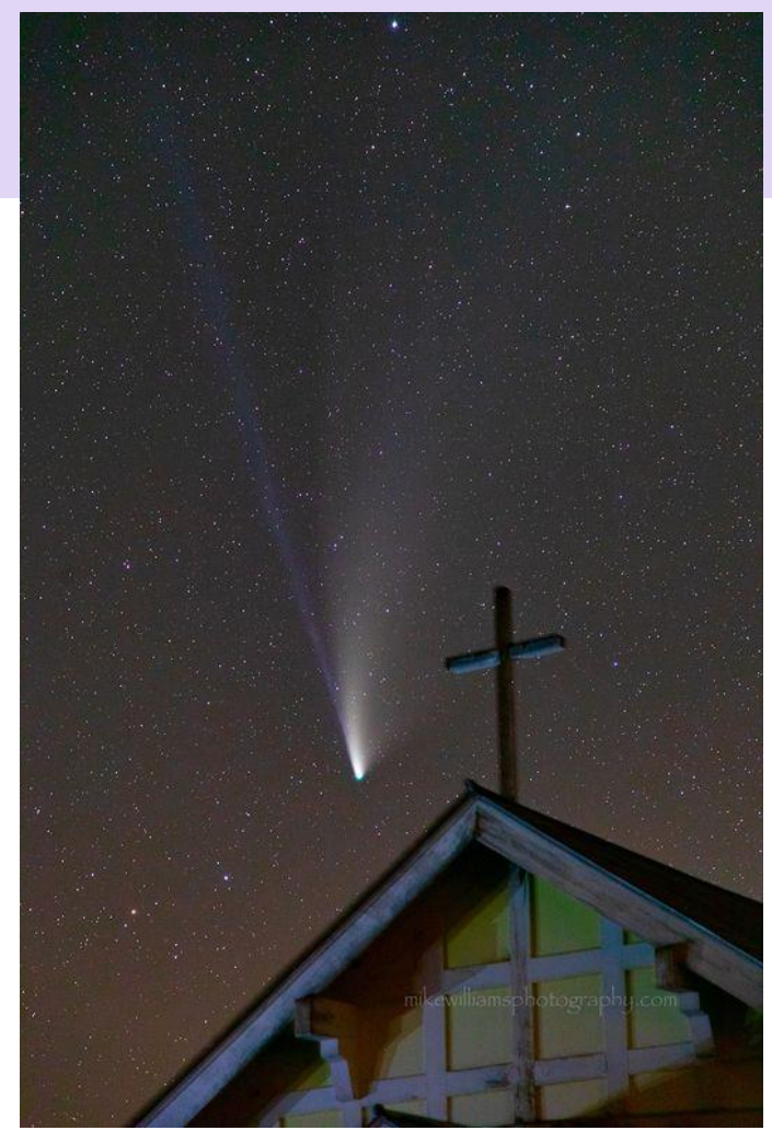
Comet Neowise.

And when we can't hold it all together, we know that God will hold us all together. Amen.