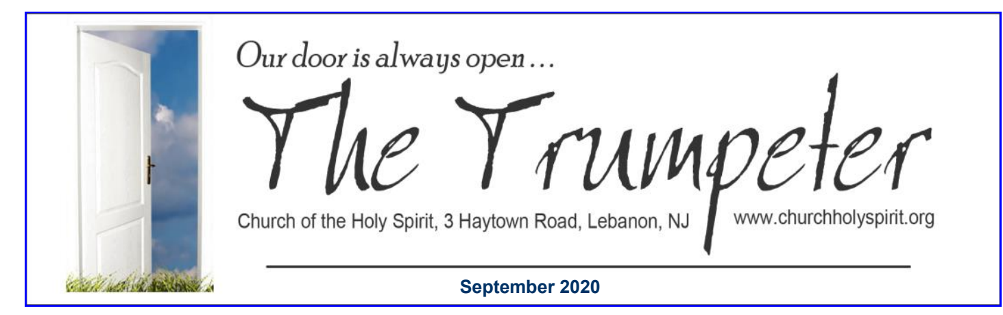
OUR MISSION: To follow Christ as we serve others, proclaim God's love, and grow in The Spirit.