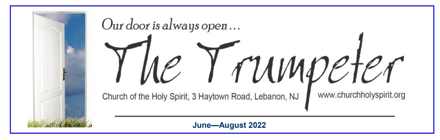
OUR MISSION: to become Christ as we serve others, proclaim God's love, and grow in the Spirit