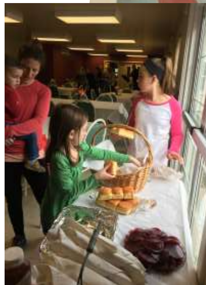
Mirota Luncheon Saturday January 13