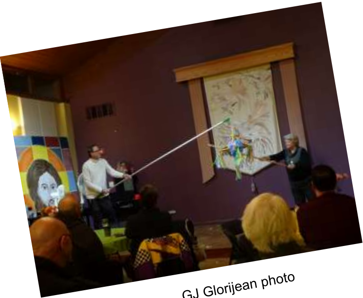
GJ Glorijean photo