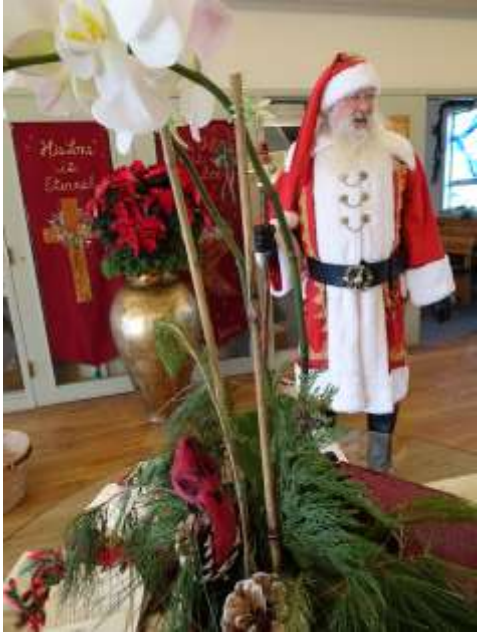
GJ Glorijean photo