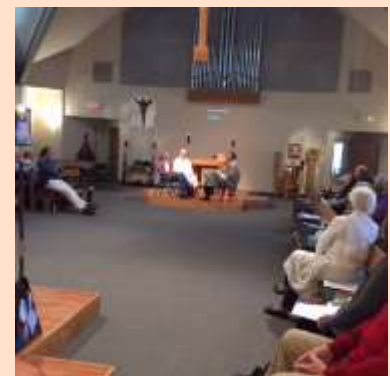
Annual Meeting 2018